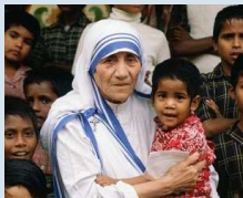
Perhaps to help many throughout the world

Not only are people physically unique but they are created by God for a unique purpose.