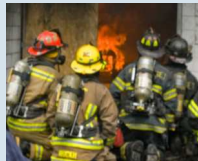
Or to help a few in our own community