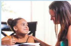
Or to extend a loving touch to one other person

All the days ordained for me were written in your book before one of them came to be.