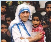
Perhaps to help many throughout the world

Not only are people physically unique but they are created by God for a unique purpose.