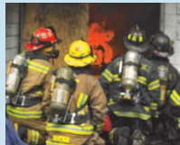
Or to help a few in our own community